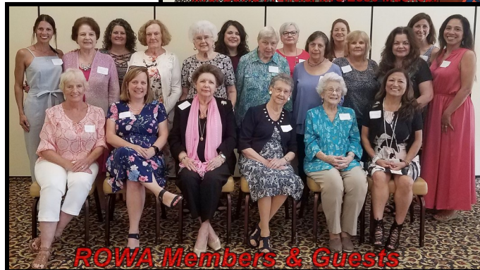
ROWA Members & Guests